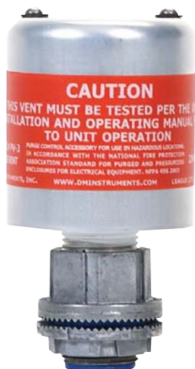
PV-3-T Top Mount Purge Vent