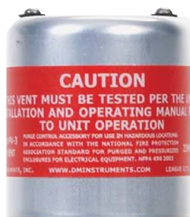
PV-3-S Side Mount Purge Vent